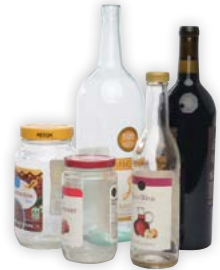
Bottles and Jars Empty, rinse and replace cap.