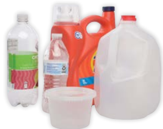
Kitchen, Laundry, Bath Bottles and Containers Empty, rinse and replace cap.