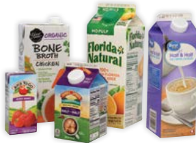
Food and Beverage Cartons Empty, rinse and replace cap.