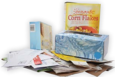
Mixed Paper, Paper Board, Newspaper and Magazines Flatten cardboard and boxes.