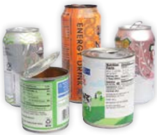
Aluminum and Steel Cans Empty and rinse.